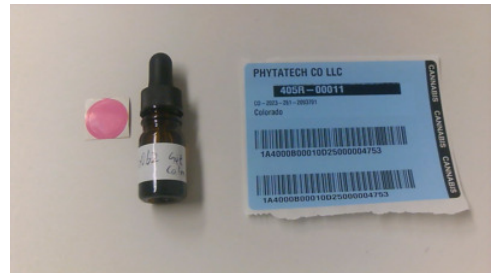
Apr 25, 2024 | Peak Therapeutics